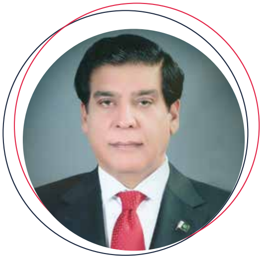
Mr. Raja Pervez Ashraf (Speaker of National Assembly)

The guest of honor Mr. Raja Pervez Ashraf (Speaker National Assembly) addressed the participants in the inaugural session and said that interfaith dialogue should be promoted in the country, pointed out communal disharmony is born when people practice faith in selfish and inauthentic ways and that needs to be addressed, all the citizens should play an active role to make Pakistan a peaceful country for the followers of different religions. He further added that this Conference will provide an opportunity for political and religious leaders to take stock of the various initiatives aiming to enhance inter-faith and intercultural dialogue and agree on a roadmap of people-centered measures and action to better translate their various commitments into national and local realities. He thanked the FoRBLN and IRI for taking lead in organizing this event, and hoped that such dialogue will continue, he recommended liaising effectively with government institutions and Parliamentary partners as well as key faith leaders to promote the culture of equality in Pakistan. He assured in this respect his party will support the other faith's concern in the parliament. He appreciated that FoRB has really done an excellent job.